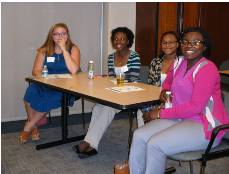
Photo: Project SEED summer 2016 students attending the career panel event.