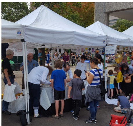
Bottom: Volunteers at the National Chemistry Week outreach event at Eaton Elementary School in DC on October 15th.